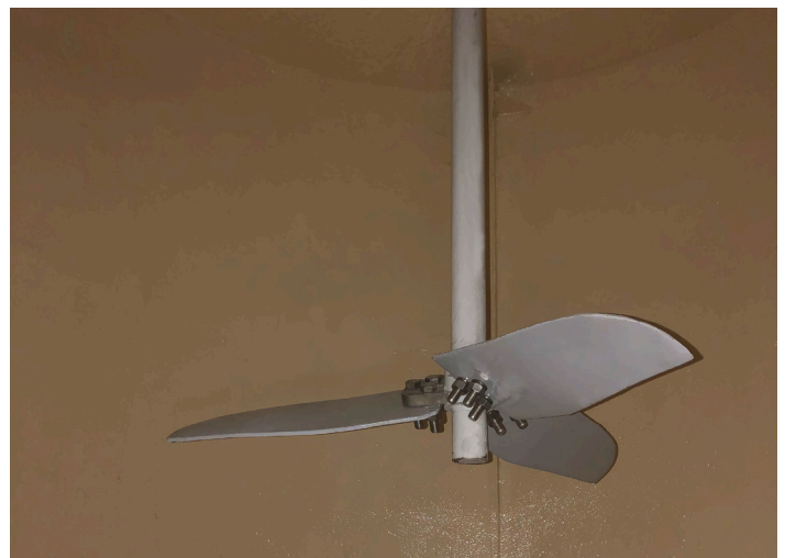
4. Finished interior of mixing tank with restored mixing blades.