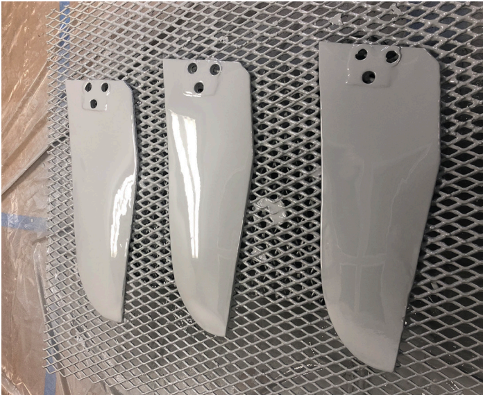
3. Mixing blades coated with Novocoat SC3300 Novolac Epoxy Lining.

When industrial settings demand quick repair solutions of key assets, ErgonArmor delivers with its Novocoat™ line of repair products that saves both time and money.